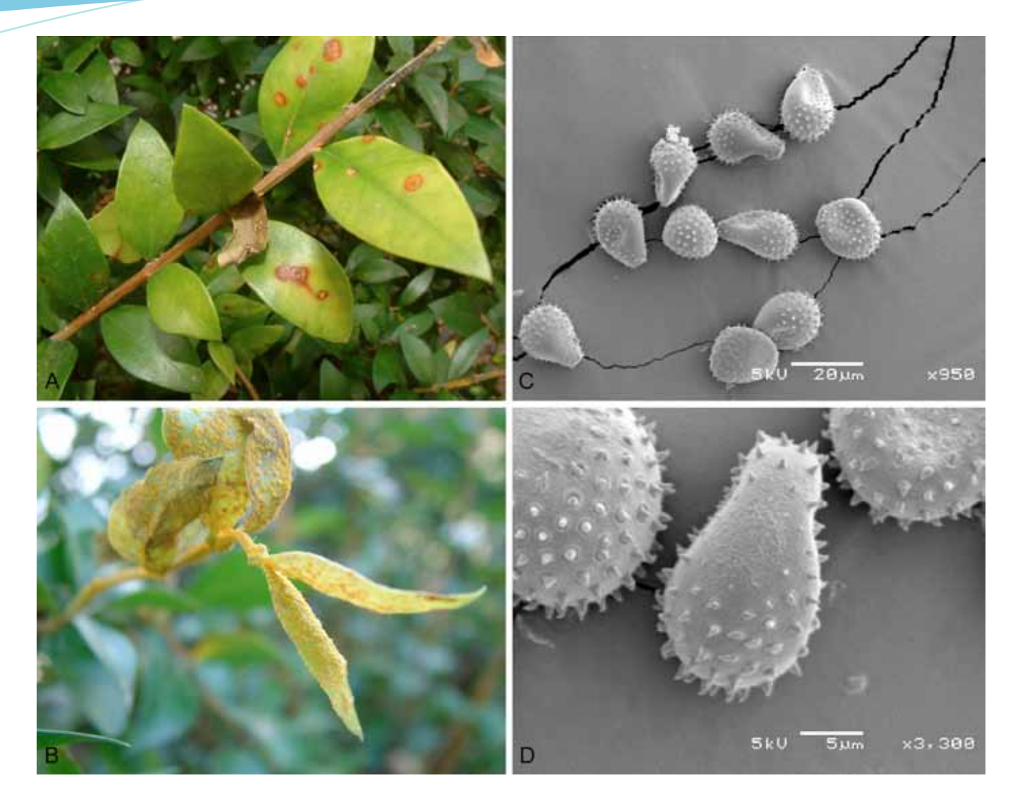
Fig. 1. Puccinia psidii on Myrtus communis in South Africa. A. Leaf spot on Myrtus communis. B. Yellow masses of urediniospores covering a dying M. communis shoot tip. C–D. Urediniospores with echinilations and smooth pathes (tonsures).

included leaf spots and cankers on young shoots/petioles (Fig. 1). Infected tissues were covered with yellow urediniospores. Spores were collected directly from infected material and used for morphological and DNA sequence studies (Table 1).